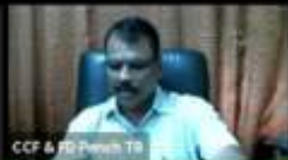
CCF & FD Parash TR